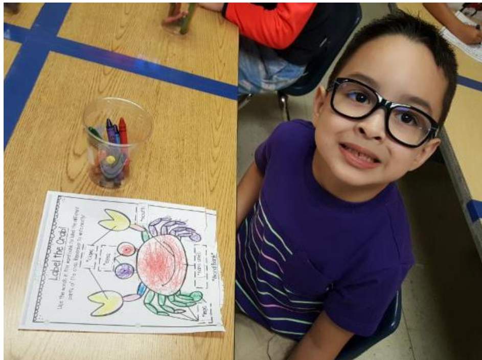
We labeled the parts of a crab!