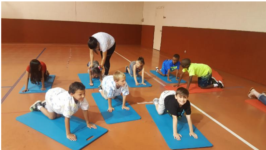
We learned the crab yoga pose in gym!