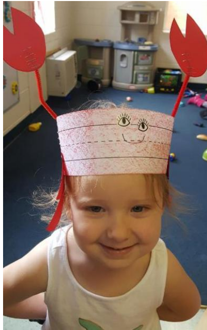
We made crab hats!