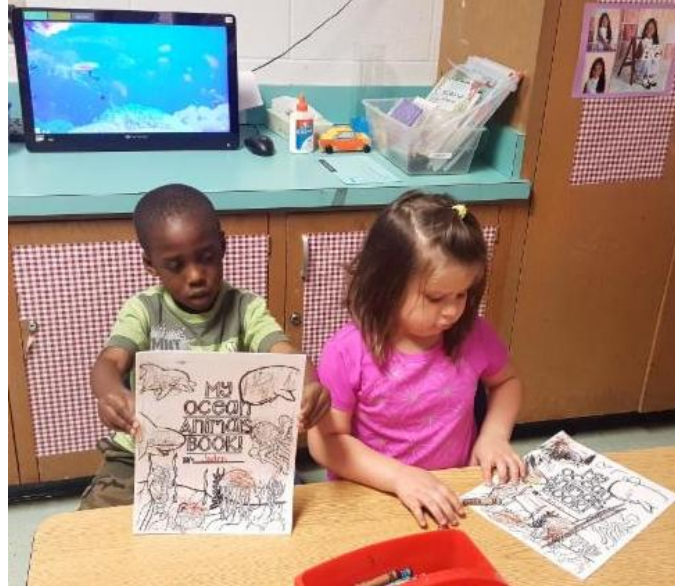
We colored pretty ocean pictures!