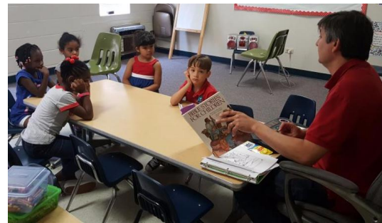
The exiting kindergarten class learned about the Magi using the stars to find baby Jesus!