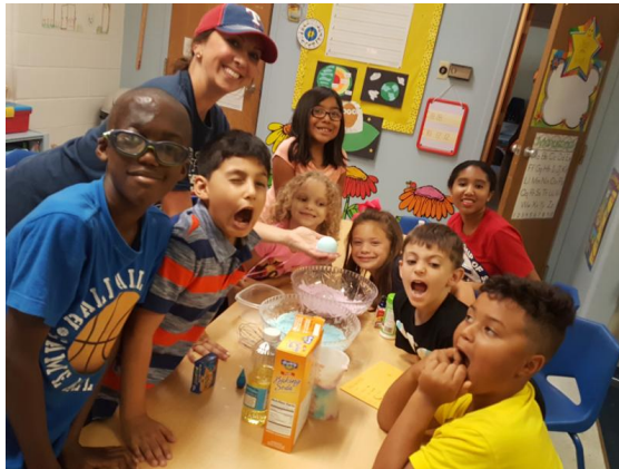
The 7-10 year olds made planet bath bombs!