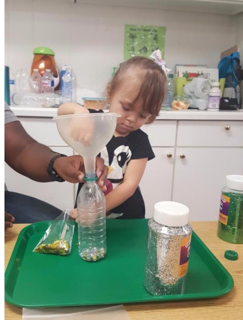
The 2s made a galaxy in a bottle!