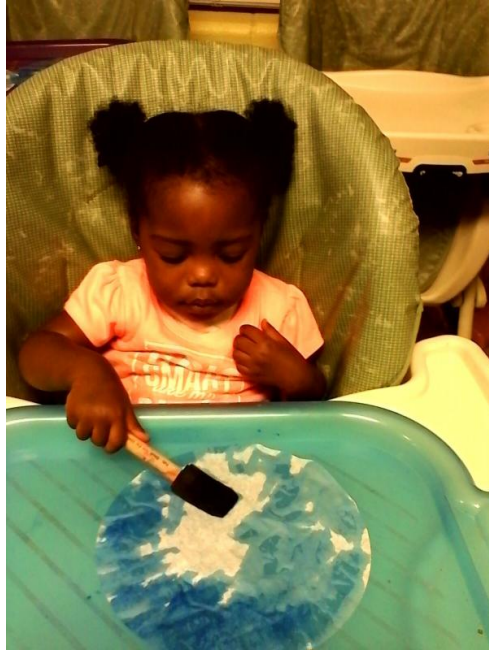
The 1s painted Earth!